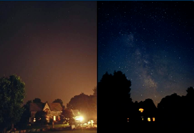
Light polluted sky

Light pollution extends beyond obscuring our view of the stars; it disrupts the natural behaviors of wildlife, affecting migration and feeding patterns, and can even be fatal. It also hinders plant-pollinator interactions by altering the circadian rhythms of both plants and their pollinators. Furthermore, dark skies are not only essential for stargazing but also contribute to human health by aligning with our natural sleep cycles, which artificial light can disrupt.